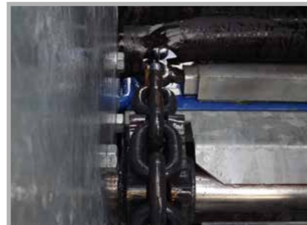
16mm high tensile chain