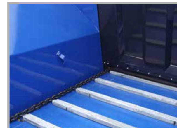
Galvanised floor lats