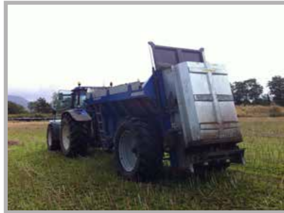
Compost spreading kit