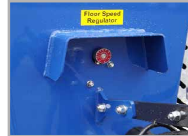
Floor speed controller