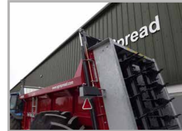
Automatic fold down lights