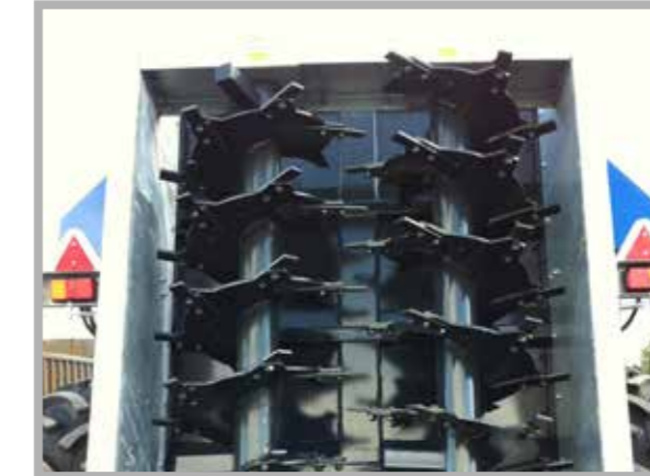
Dynamically balanced twin vertical beaters