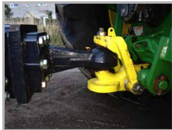
Ball & spoon type hitch