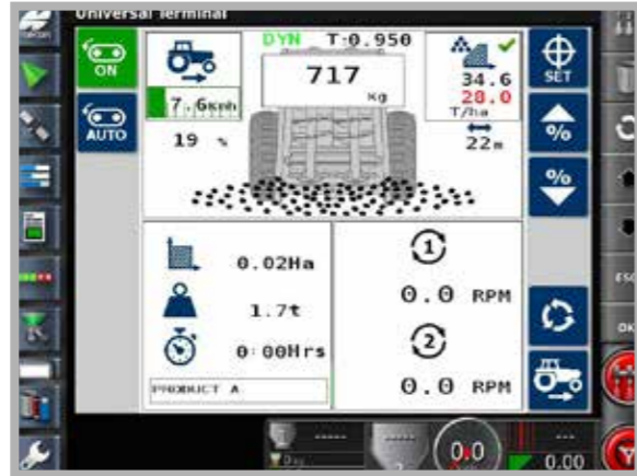
Apollo or Isobus controller options