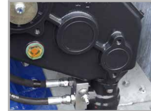
Blow off valve